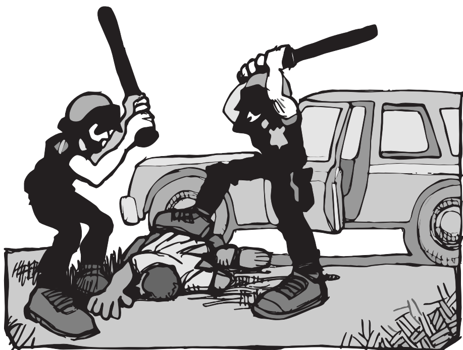
RODNEY KING, L.A. 1991