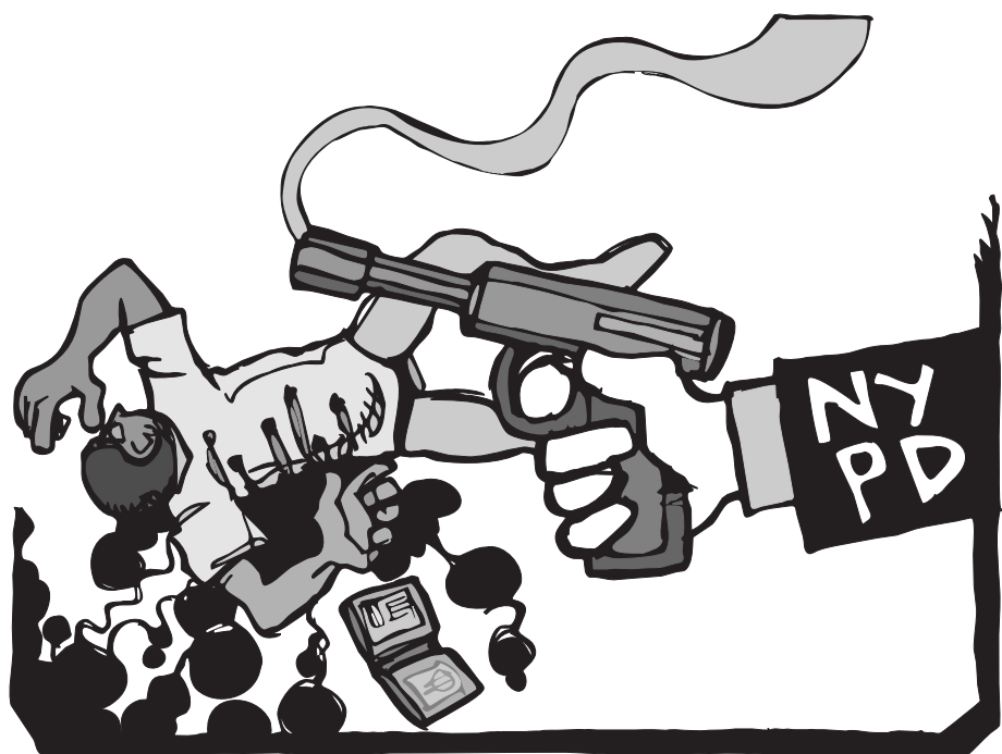
AMADOU DIALLO, N.Y.C. 1999