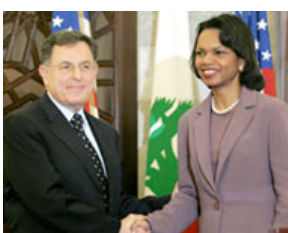
Rice met the Lebanese prime minister in February