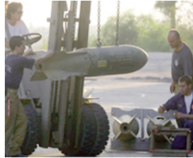
So far Israel has mainly attacked Hezbollah from the air