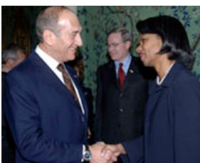
Rice says she has been in constant contact with Ehud Olmert

"The fact is that they avoid publishing the number of their losses, the names of their men that were killed, and the fact that they feed the press