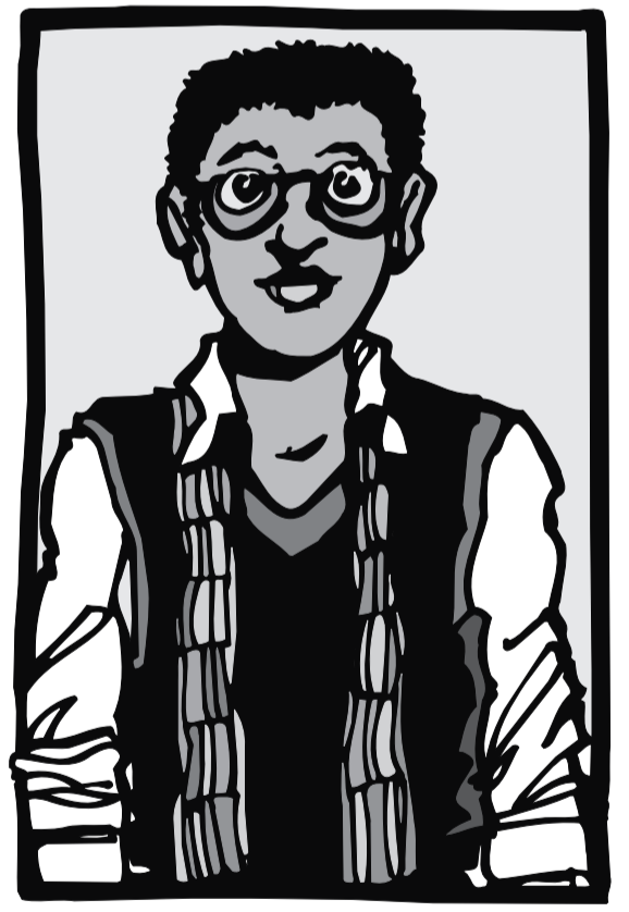
ONE MILLION BLACK MEN

So, FORGET ACCOUNTABILITY! FORGET PERSONAL INVOLVEMENT! THROW AWAY YOUR TROUBLES and RELAX with your latest selection from the ENEMY OF THE MONTH CLUB!