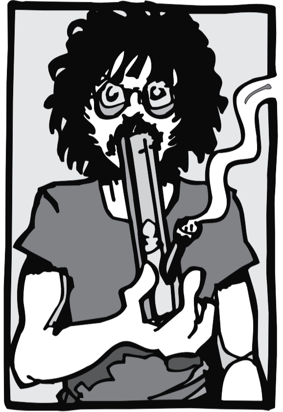
CASUAL DRUG USERS