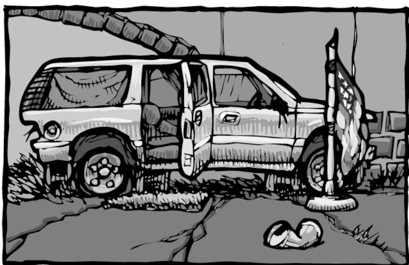
AMERICAN CLASSIC! 2000 SUBURBAN Under a convenient overpass near Union Station. Close to Metro and shopping. $100k.