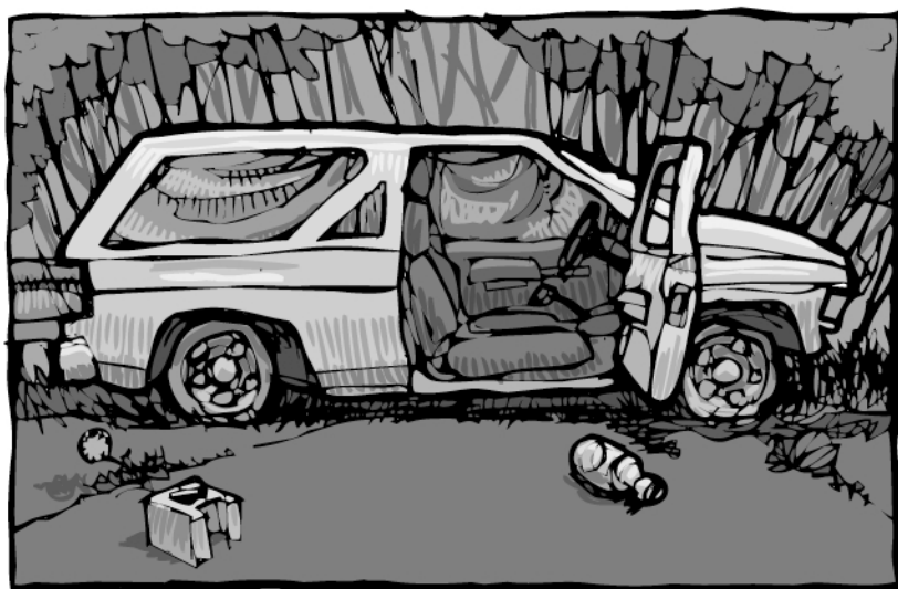
HISTORIC FIXER-UPPER! 1987 PATHFINDER on 380 spacious square feet behind the old Hecht's warehouse near Rhode Island Ave. Close to Metro and shopping. $75k.