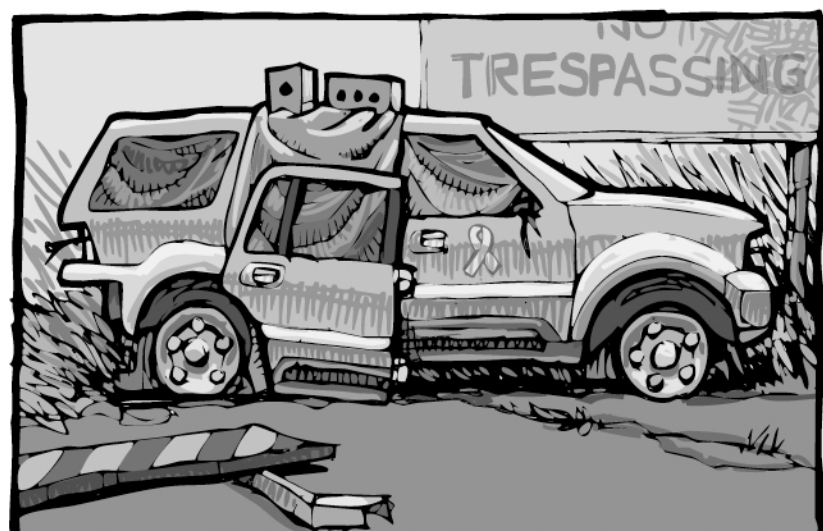
LAP OF LUXURY! 2004 NAVIGATOR In an exclusive Rockville cul-de-sac, freshly bulldozed. Close to Metro and shopping. $200k.