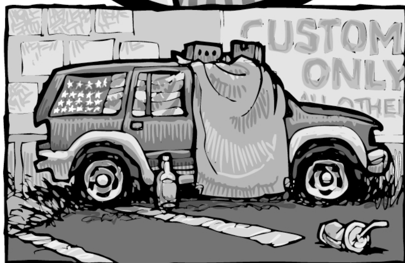
LOCATION, LOCATION, LOCATION! 1999 EXPLORER On the main lot of a vacated "big box" store in SE. Close to Metro and shopping. $125k.